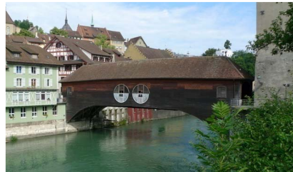
Cool covered bridge in Aarau