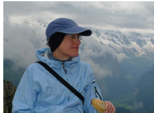
Alpine peaks hiding behind the clouds