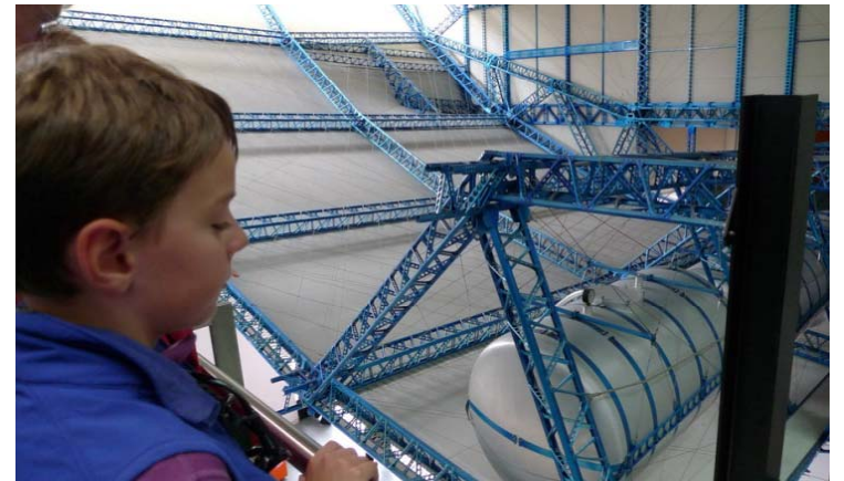
The Zeppelin Museum in Friedrichshafen