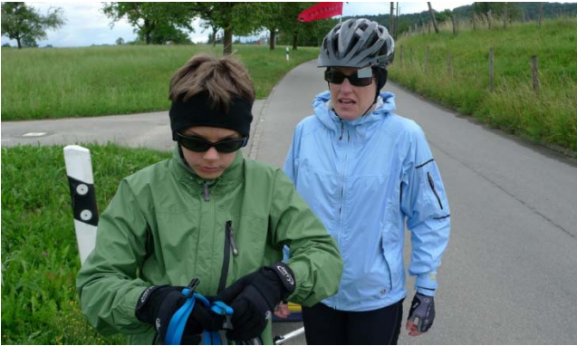
Trying to keep warm