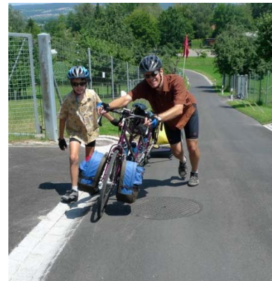
Some hills were too steep to ride