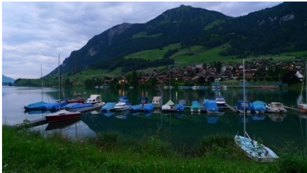
Evening view from campsite in Lütschwil