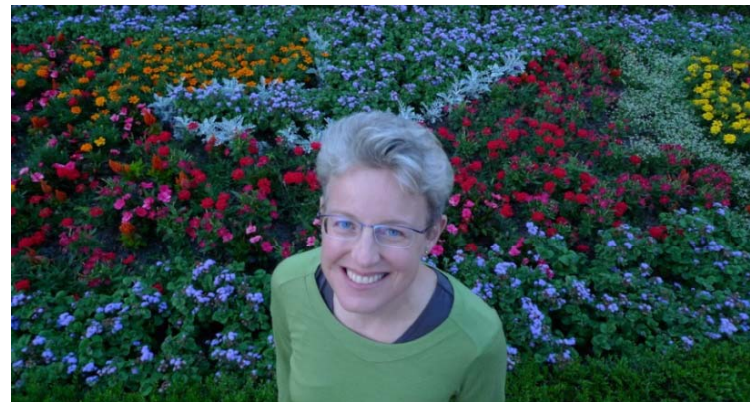
Beauty in front of beauty