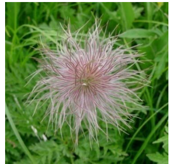
More Alpine flowers