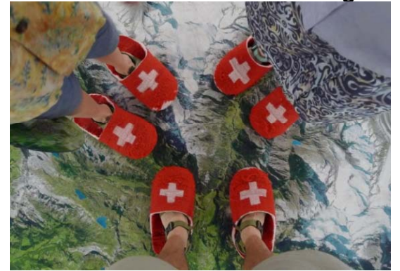
Felt shoes protect the map