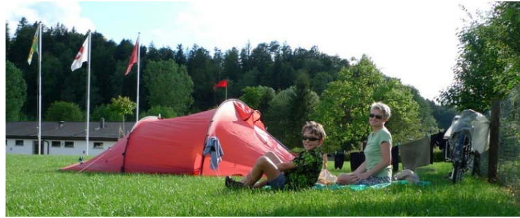
Beautiful campsite in Lütschwil