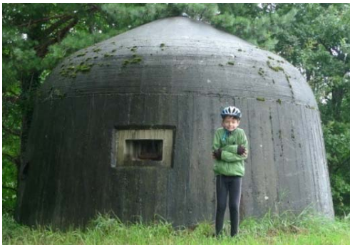
Unused WWII defenses