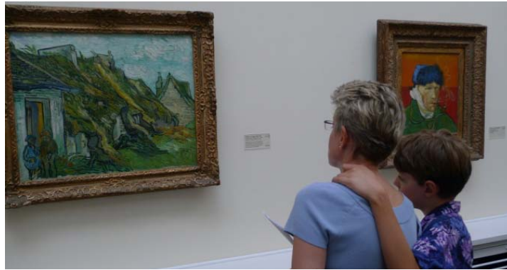
Contemplating a Master