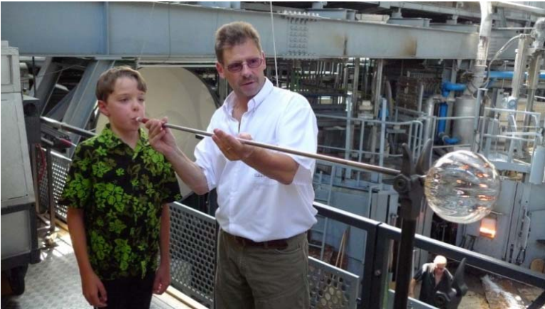
Blowing glass at the Glass Museum in Hergiswil