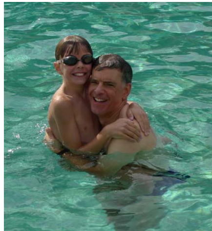
Huddled for warmth in a COLD pool