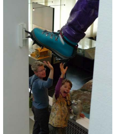
Attacked at the Alpine Museum