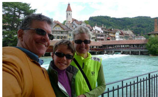
Covered bridge and dam in Thun