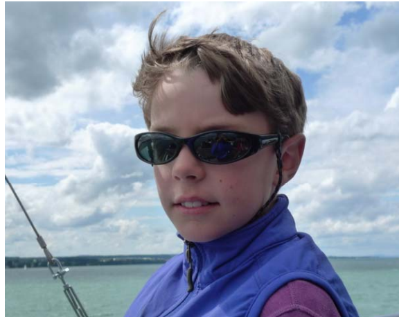
On the ferry from Friedrichshafen to Romanshorn