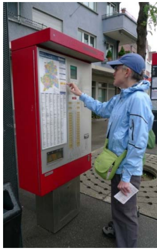
Buying bus tickets