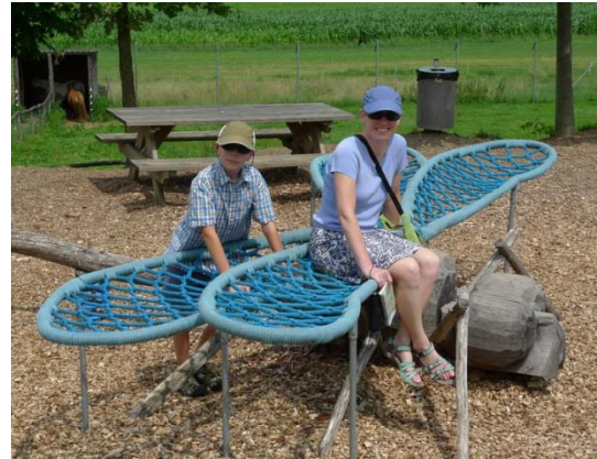
Dragonfly play structure