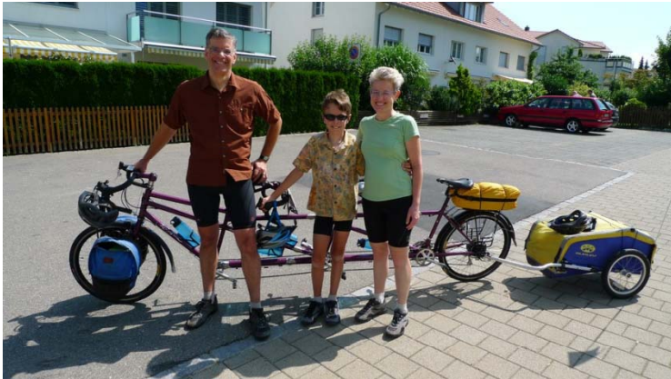
Starting out in the sunshine of Zurich