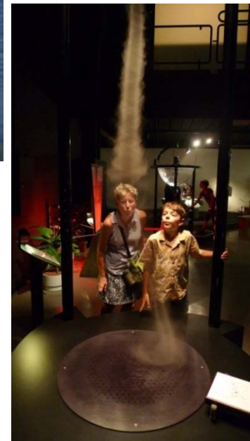
Technorama in Winterthur