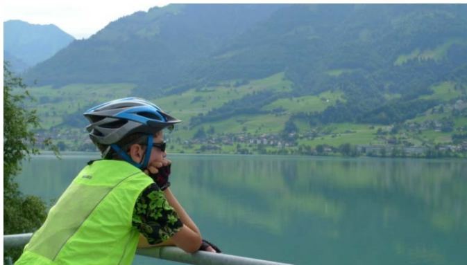
Admiring the view of the Sarner See