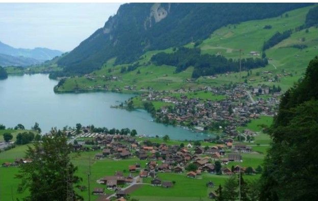
Incredibly beautiful town of Lungern