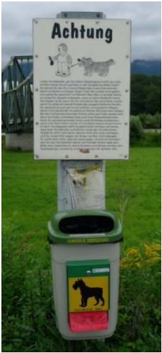
Dog poop bin