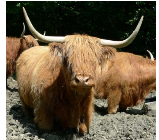
Fuzzy Alpine cow