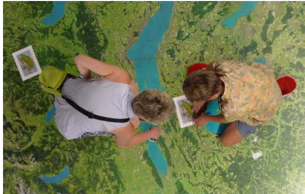
Huge map of Switzerland at Verkershaus in Luzern