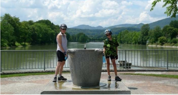
Water fountain by a Kraftwerk hydroelectric dam