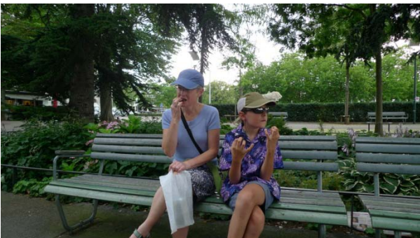
A chocolate snack after shopping in Zurich