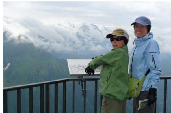
Cloud shrouded Alps from above Interlaken