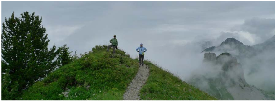
Among the clouds about 1500 meters above Interlaken