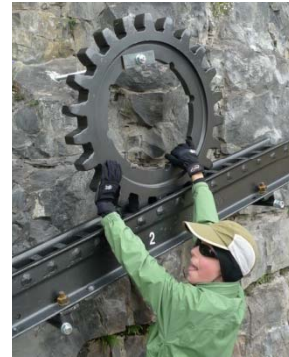
Cogs for Alpine railway