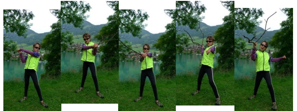
No sticks were injured in the taking of these photographs