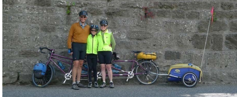
Family portrait with bike