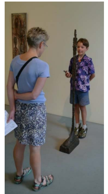
Art Museum in Zurich