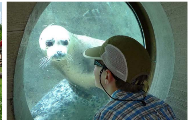
Close encounter at the Zurich Zoo