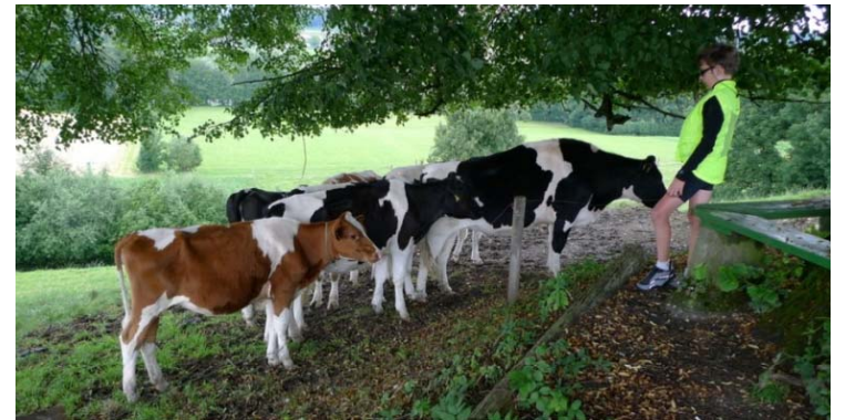
Meeting some of the locals