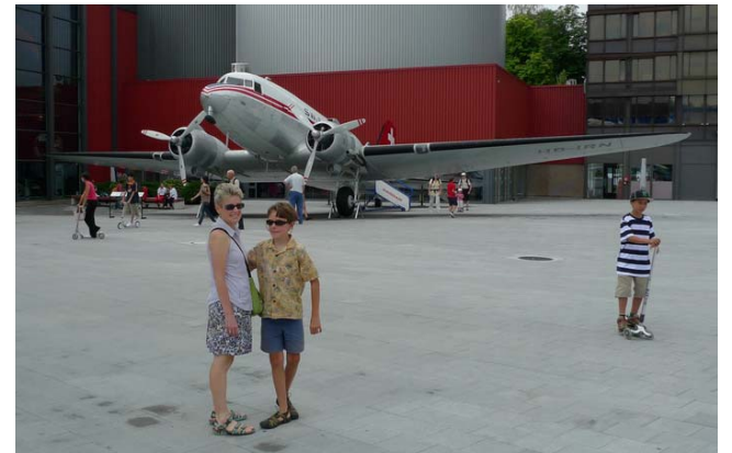
A DC-3 at the Verkershaus Museum in Luzern