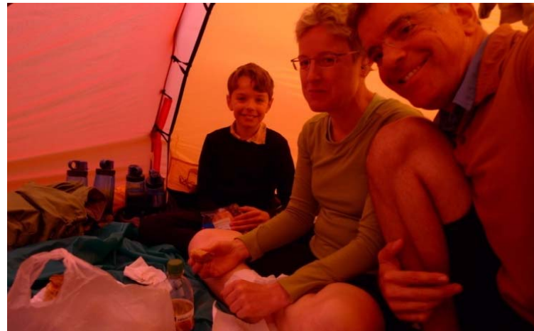
Fine dining while keeping dry in the tent