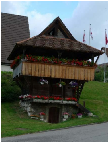
One of many old homes