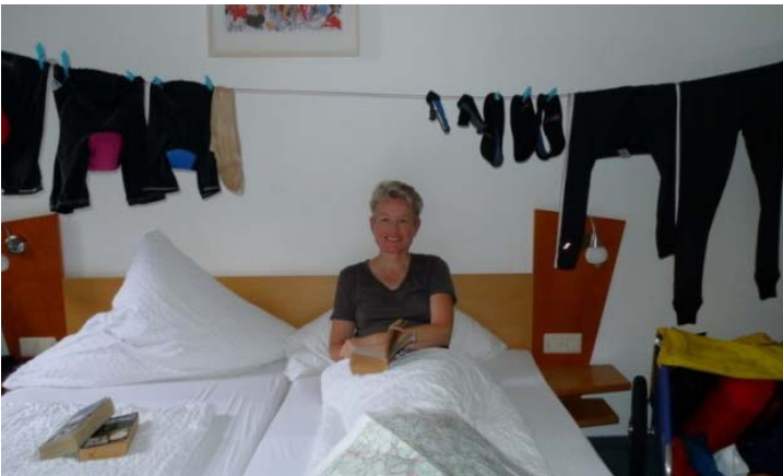
Drying out after two days of constant rain