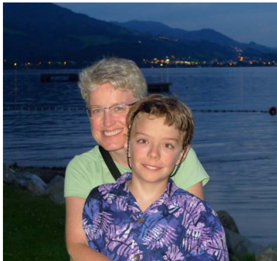
My lights shine as the sun sets