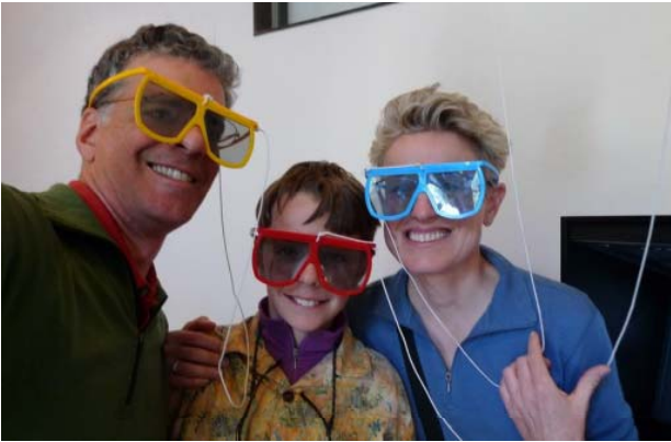
3D glasses at Alpine Museum in Bern