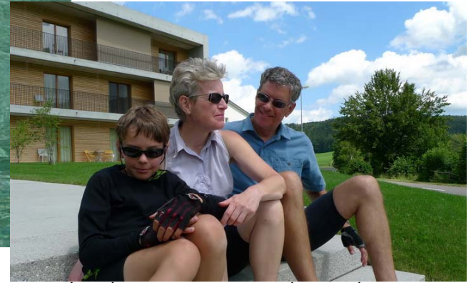
Lunch on a rare sunny and warm day