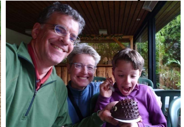
Eating Igeli shaped cake in Bern

We almost saw some of the most beautiful scenery ever during our 460 miles of riding in Switzerland. Unfortunately, in our three weeks it rained at some time during every day but two. We hiked through low clouds in the Alps during a day off in Interlaken and caught occasional glimpses of the peaks. What we could see was very nice. Our nerves barely survived the ride over Brünigpass in a cold wind while being passed by a constant stream of trucks and motorcycles. Our favorite site was the Glass Museum in Hergiswil, but our favorite place was the home of our Warm Showers hosts in Zurich. They were wonderful beyond reason.